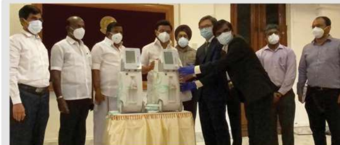
Receiving oxygen concentrators

GCC under the guidance of the Tamil Nadu Government also enhanced the city's oxygen producing capacity by encouraging many companies and organisations to install medical oxygen generators and plants.