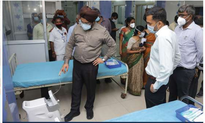
Procuring more beds with medical oxygen facilities