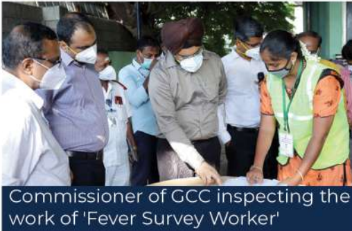
Commissioner of GCC inspecting the work of 'Fever Survey Worker'