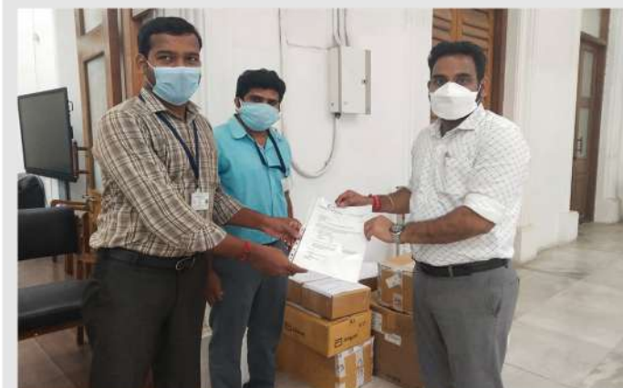
Receiving medical equipment