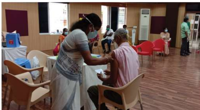
4 Special camps through bulk registration for organisations, companies, NGOs and associations