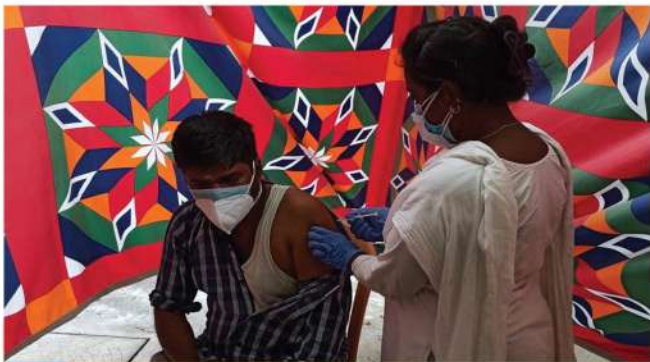
5 Focusing special camps for frontline workers and essential service providers through bulk registration