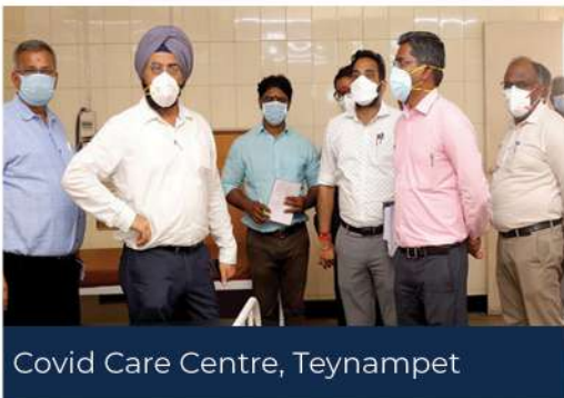
Covid Care Centre, Teynampet