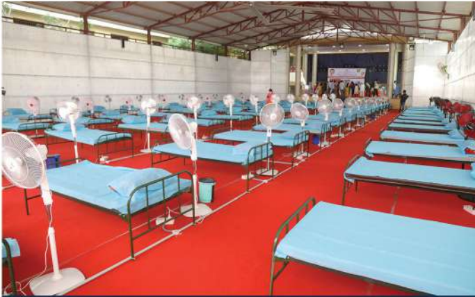
Increased number of COVID Care Centres