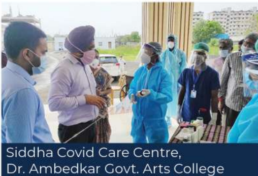
Siddha Covid Care Centre, Dr. Ambedkar Govt. Arts College