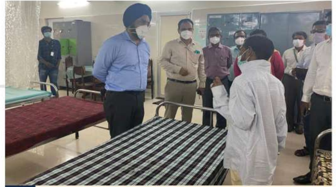
7 Prioritising vaccination for homeless persons in GCC shelters