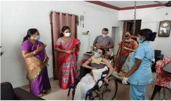
6 Home vaccination for the differently abled