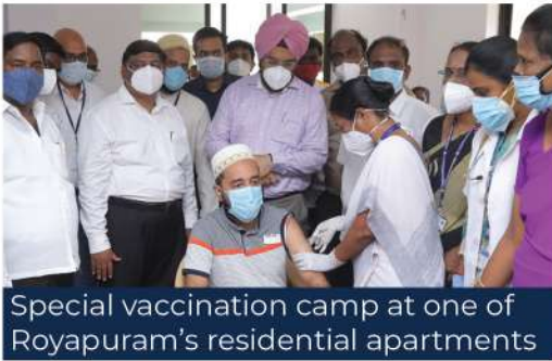
Special vaccination camp at one of Royapuram's residential apartments